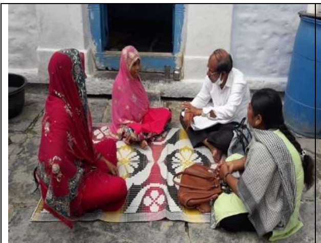
Counseling to MI PWD and Care giver (Mother)