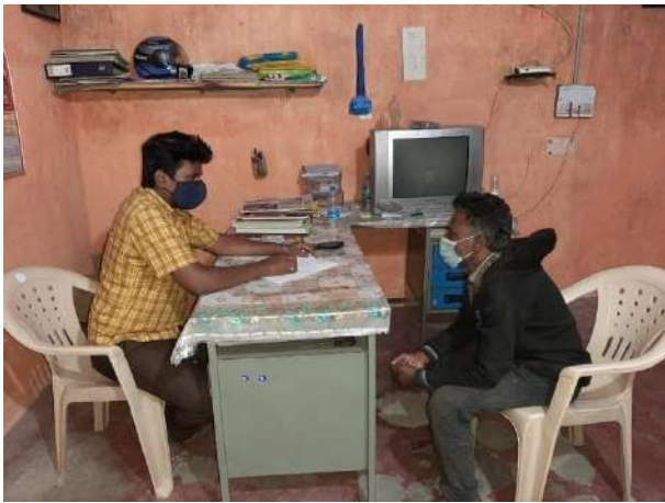
Indusual counselling to the beneficiary, and information what are the facilities are getting in the shelter, and how to be there in the shelter.