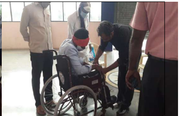
Physiotherapy conducted by Margadarshi Society Kalaburg i for PWD's with Associate Bird Heal Jevargi.