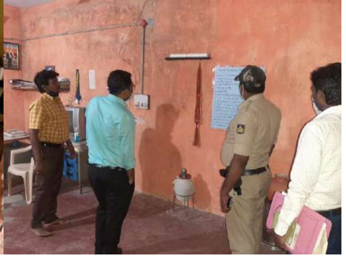
Home visit beneficiary and giving giddiness to them with family, kalaburgi Maha Nagar Palike Commissioner visited the night shelter and observing the all the documents