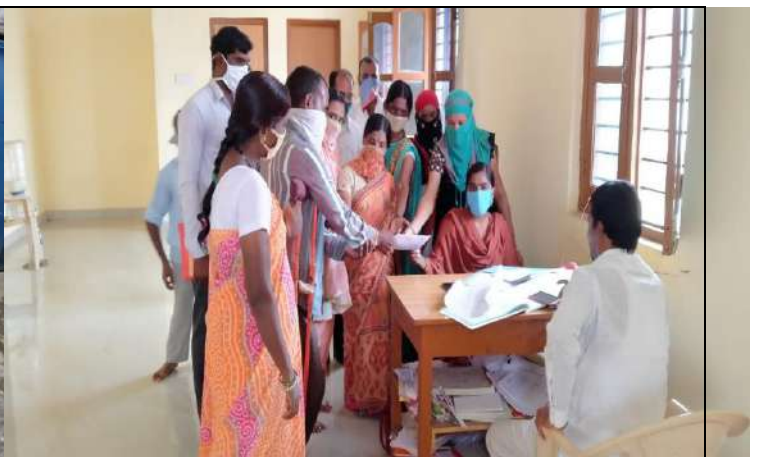
Niramay Application submitting by PWD's