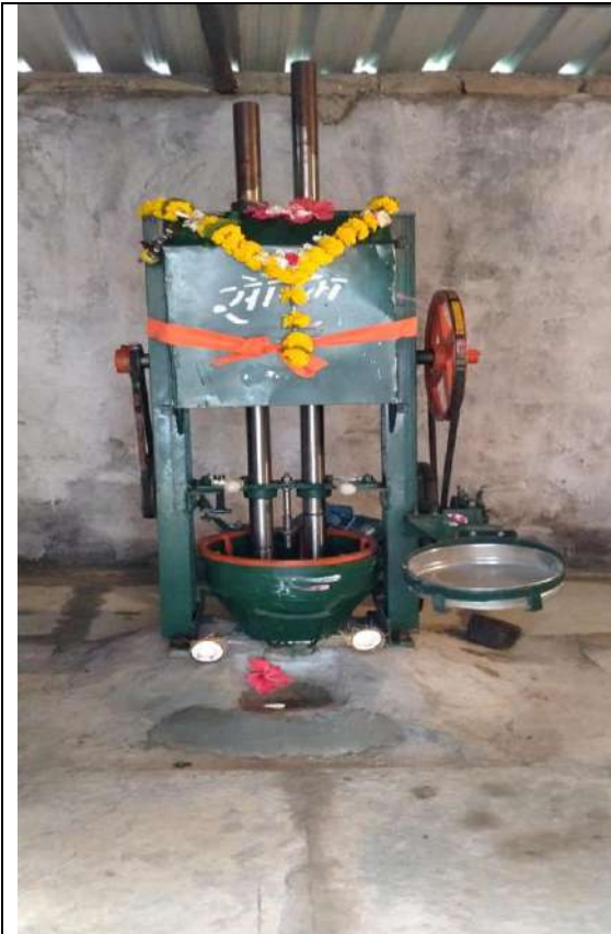
Inauguration of Chilli powder making mochion at Mugnagavi Panchayth running by PWD