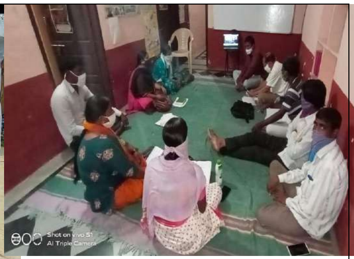
Training to the PWDs and staffs at Margadarshi Society