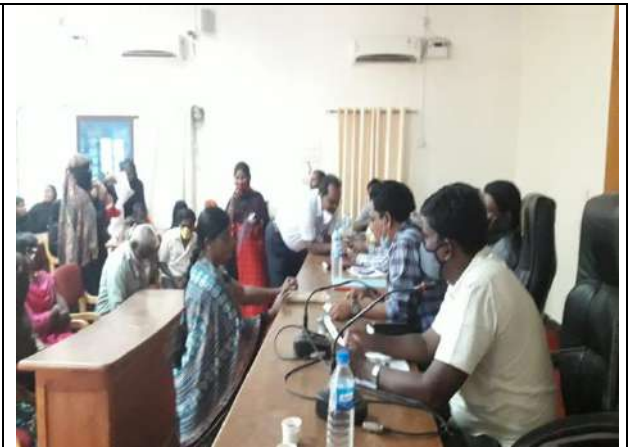
PWD's discution there issues at Tahluka Panchayth on interface meeting with the Tasildar EO, BEO, CDPO, other stake holders meeting 200 PWD's were Participated.