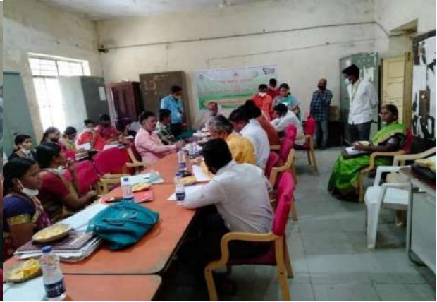
Shahabad, Sedam and Chincholi Taluk TAB meeting Photos March-2021.