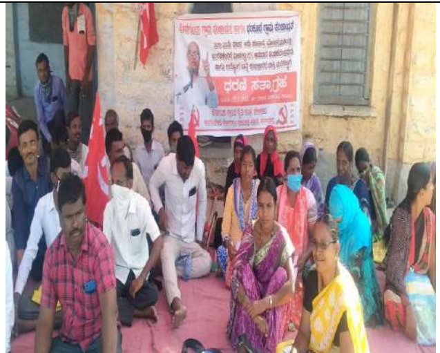
PWDs demanding gram panchayath 5% Amount to be releaz to PWD's and Work card issue of MGNRGA and other issues also, Bankur Panchayath and Thahsil office at Shahbad,