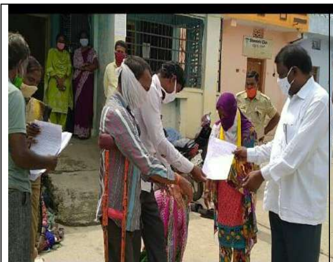
MGNAREGA application submitted to Gama