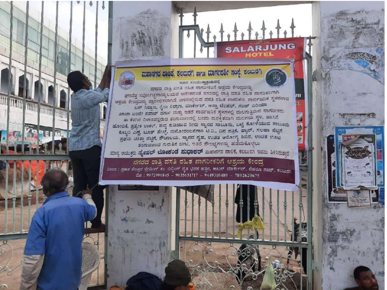
Banners display in the city regarding awareness of night shelter facilities and whom to come to the shelter and contact address.