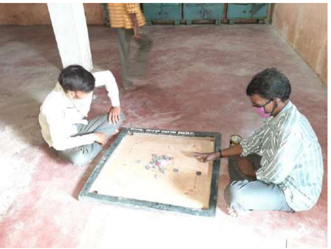
Beneficiary having food in the shelter and playing carom in the shelter